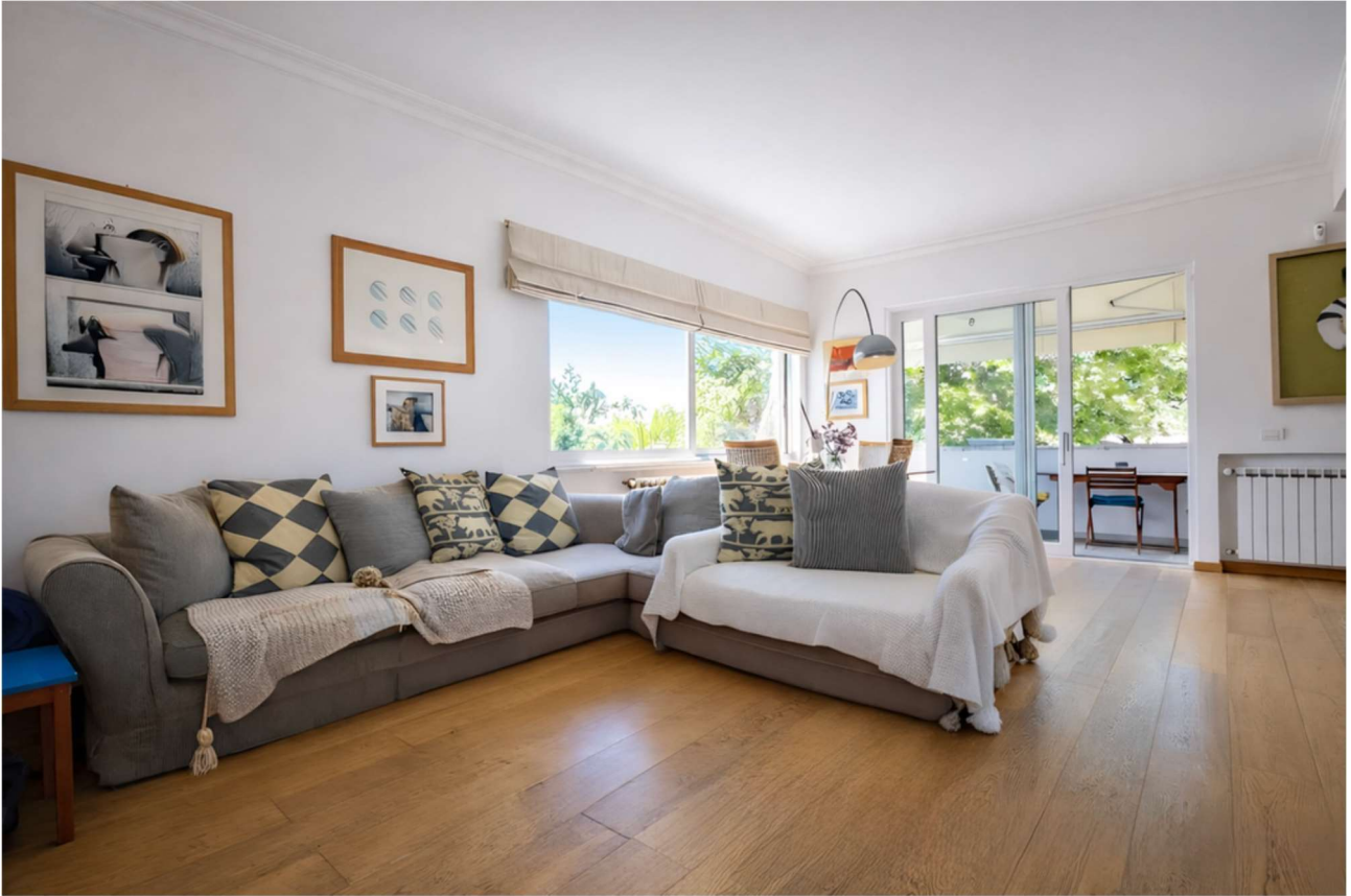
APPARTAMENTO PIANO PRIMO